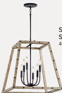
Basford™ Pendant 43520DAG

To see more from these collections visit Kichler.com.